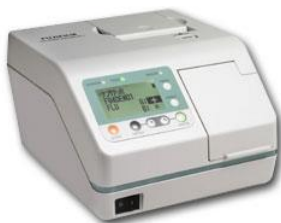
富士ドライケム IMMUNO AG1

Inspection instrument: Fuji Dry Chem IMMUNO AG1 (Novel coronavirus antigen testing system ; manufactured by Fujifilm, Japan) :